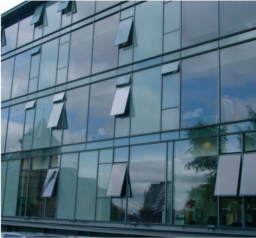
The windows facing my door