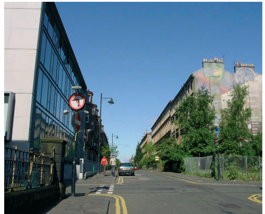
My house on Hill Street (right) and St. Aloysius' Clavius Building (left)

I arrive in Glasgow the 2 nd of January 2004. My home is on Garnethill, where the art school and a Catholic school, St. Aloysius' College, are also situated. On my way to school I'm constantly surrounded by kids in green uniforms. They come in all sizes and they fill the streets and the local shop La'tiffs several times a day. Regardless of our physical proximity, the kids somehow totally ignore me. It seems I don't exist at all for them, and sometimes I get the feeling they might just walk over me when I'm passing through Hill Street. It's hard to make sense of who they are; they feel really alien although I know they are probably just like normal kids back home, only in weird clothes.