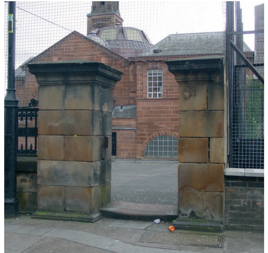
The gate to the yard

During breaktime there's a teacher on the street checking that everybody behaves well and making remarks about clothing. I'm anxious for more interaction and I walk down Dalhousie Street anyway. I notice the teacher looking at me and I panic. I'm just about to pass the gate to the yard. For some reason I think it's a good idea to sneak into the crowd in the yard and I go in through the gate.