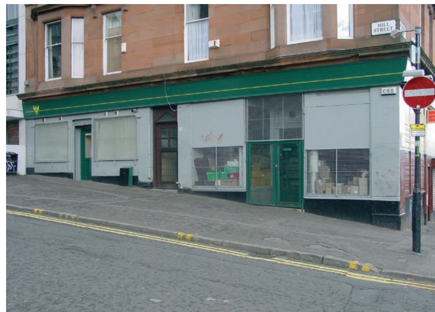
The School Shop

I go to the School Shop, where they sell notebooks etc. during lunch breaks. They also have some second-hand uniforms, and they are happy to sell me a blazer, skirt and a pullover. However, they explain that I can't try the skirt on because it's a school shop, but I should buy it anyway as the money will go to charity. The new uniforms are sold in some clothes shops in Glasgow, and the basic set costs at least £200.