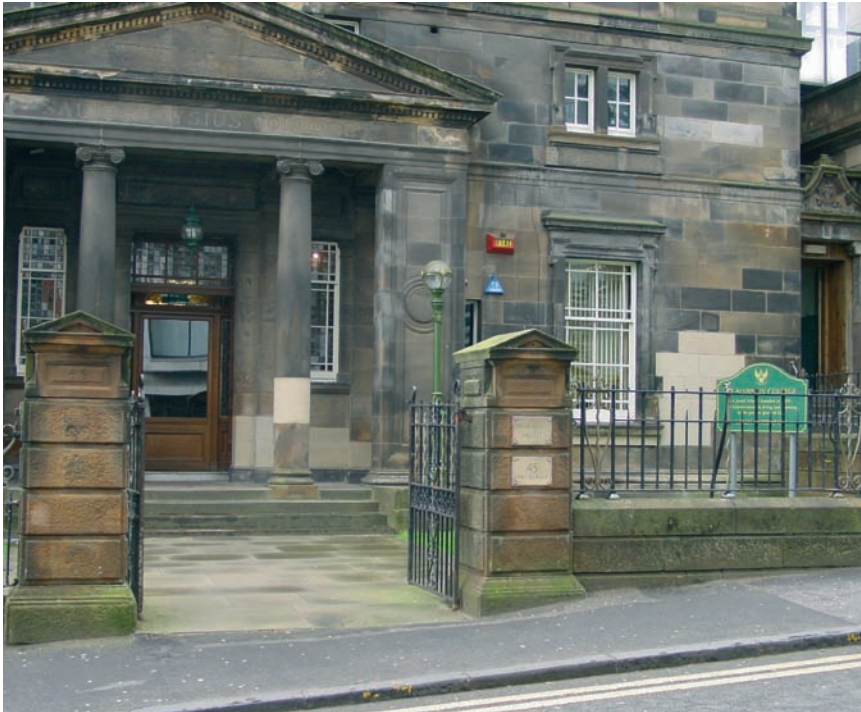
The main entrance of St. Aloysius' College

People tell me that this school is actually very special. It's an expensive private Catholic school with a strong identity and tradition. There are more than 1000 pupils from all over Scotland, everything is well controlled and exam performance is excellent. The Latin motto "Ad Majora Natus Sum", which is sewn on the uniform blazer pocket under the eagle logo, means "I am born for the better".